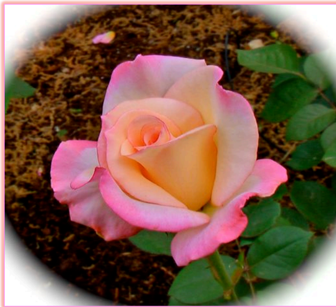
'Gemini' HT, 1999

Recipient of the Silver Medal in the 2010 ARS National Bulletin Competition